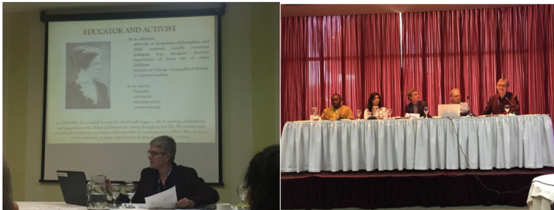
Images from the parallel sessions