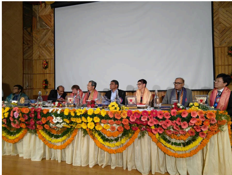
Inaugural Session at IGU, Hyderabad