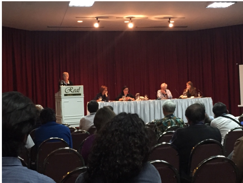
The final Plenary Session

was the occasion to know the social and geographical history of La Paz and El Alto.