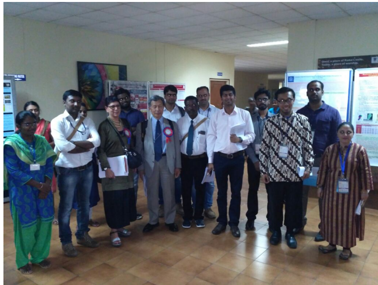
Participants of IGU-YECG Poster Award with jury and IGU-YECG representative