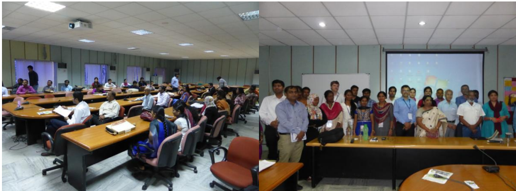
SWAT special session at IGU India Thematic Conference, Hyderabad. Valedictory Ceremony

river basin. Scholars in their presentations also dwelled upon the delineation of watersheds for a sustainable development of land and water resources, calculation of stream flow and precipitation using SWAT, adaptation techniques, assessment of ecosystem services in a watershed and water efficiency for agriculture, SWAT analysis for hydro projects and impacts of urban and industrial growth on the transformations in spatial distribution of water bodies. Arc-SWAT tool used to delineate the boundary of watershed and Web Based Hydrography Analysis Tool was also discussed through presentations by the academicians. There followed a vibrant discussion.